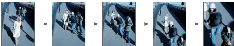
60 frame/sec @ D1 Resolution